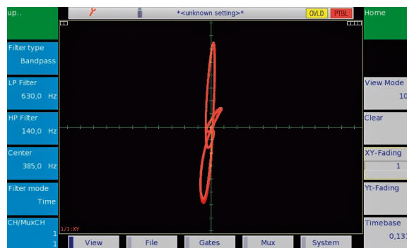
XY display during crack detection